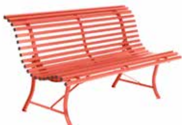
1000 - BENCH 150 CM

Steel frame 20 square electro-galvanised steel tube slats Delivered unassembled