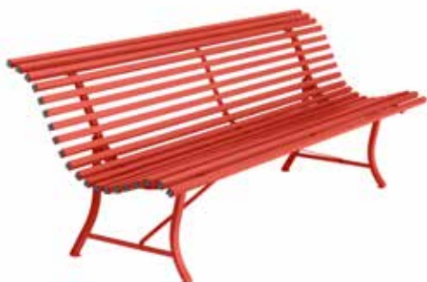
1001 - BENCH 200 CM

Steel frame 20 square electro-galvanised steel tube slats Delivered unassembled